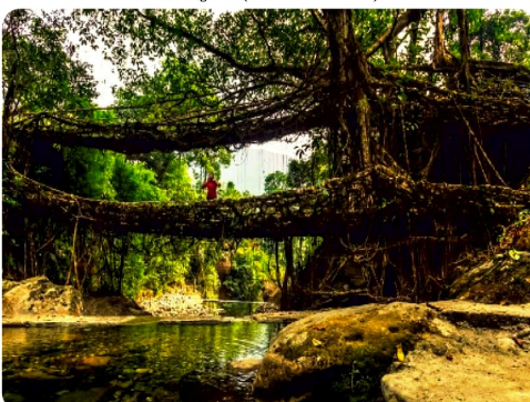
Living root bridge (Picture from Internet