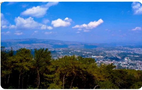
Shillong Peak

es in and around Shillong bring out its natural side and mesmerizing hilly vibes. Away from the hustle-bustle of city life,