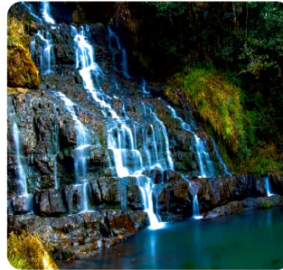
Elephant Falls